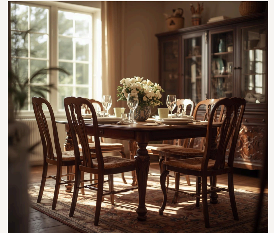
Table and chairs for meals and gatherings.

Recommended order: Bedroom ➡ Living Room ➡ Dining Area ➡ Other Rooms